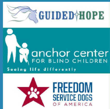
Our 2016 charities!

For complete details, please visit http://insplace.com/referrals.html .