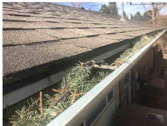
Winter winds can add a surprising amount of debris to the gutters.

"When spring came, even the false spring, there were no problems except where to be happiest." - Ernest Hemingway